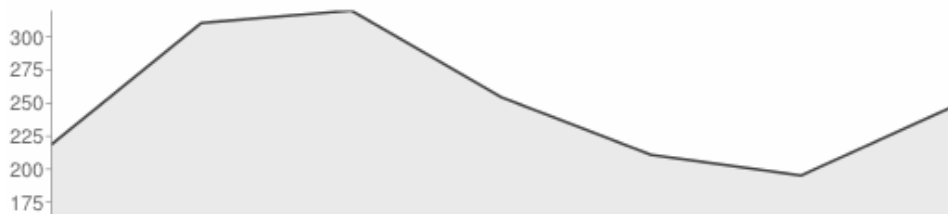
Graf vzpona (m)